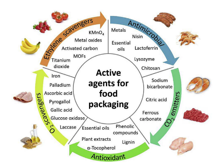
Fig. 2. Active agents for active food packaging.

Numerous excellent reviews on food packaging systems with active features have been published recently, including the appraisals on innovative active, intelligent and bioactive food packaging technologies