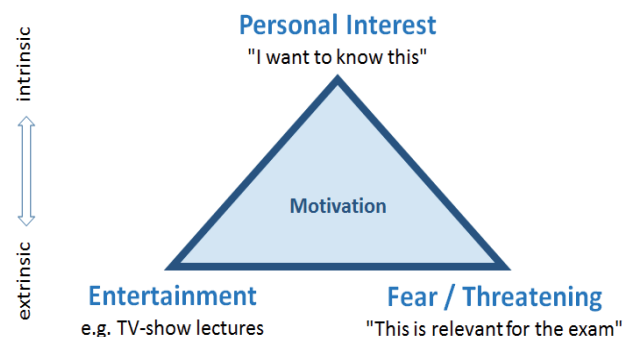
Fig. 1. Motivational factors for student attention

How can teachers deal with these effects? Would students be more attentive if pedagogical approaches were more student-centered, like peer-to-peer learning, flipped classroom or problem based educational approaches? Or are there other extrinsic means to increase students' attention? Students are