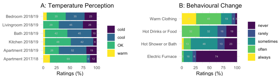
Figure 3: A: Distribution of perceived temperature ratings in different rooms. The last row represents the perception of temperatures from a baseline inquiry in the heating season 2017 / 18. B: Ratings of behavioural changes, triggered by the temperature reduction.

Responses to the two other questions confirmed that residents have a high acceptance for environmental topics (Figure 2; A and B), with responses being largely independent of the information about the intervention. Interestingly, only 50 % of all respondents reported to have perceived a change in indoor air temperature since the beginning of the intervention. Somewhat in contrast to this finding are responses to the question of how temperatures were perceived (Figure 3; A). Temperatures are generally rated as quite cool. This is most evident for living room temperatures, which are rated as too cold by 26 % of all participants and as OK by only 29 % ( Livingroom 2018/19 ). The acceptance for similar low air temperatures in bathrooms and kitchens is higher ( Bath, Kitchen 2018/19 ).