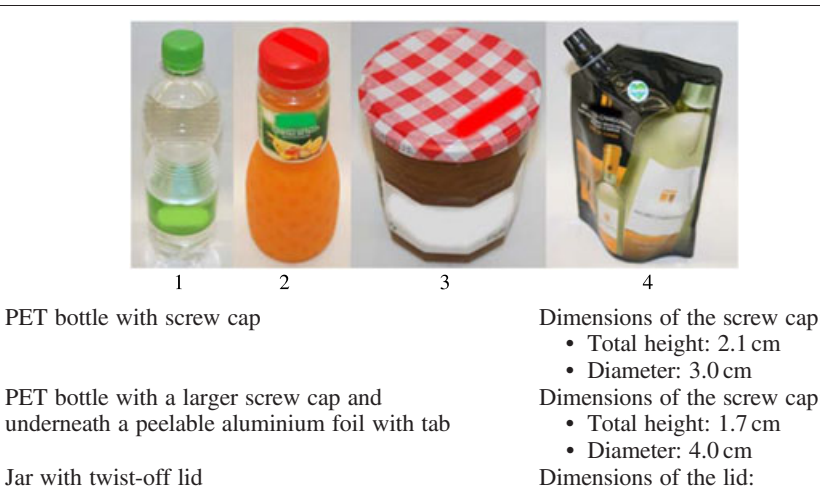
Packaging systems with torque closure

Table 1. Packaging types used in the study (photographs represent the packages used in Switzerland).