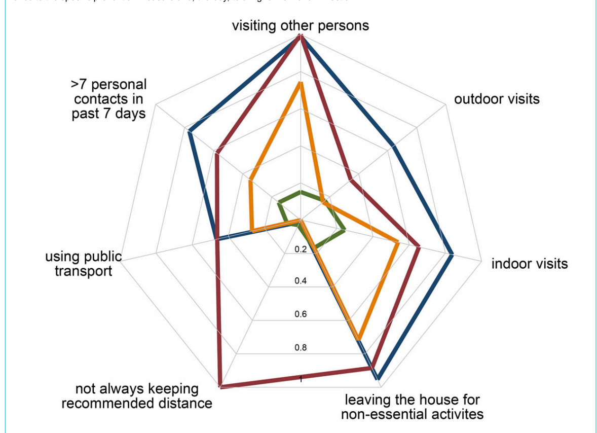
Figure 2: Radar plot visualising findings from an exploratory factor analysis on self-reported adherence to recommended preventive measures among elderly persons in Switzerland. Colours correspond to the four distinct groups presented in table 2: "good adherence to preventive measures" (blue; group 1, n = 86), "many social contacts and relatively low adherence" (red; group 2, n = 26), "few contacts and few social activities" (green; group 3, n = 66), "few contacts but more social activities" (yellow; group 4, n = 78). Lower values correspond to lower adherence to the specific prevention measure and, thereby, to a higher risk for an infection.

Our study has several limitations which merit consideration. The Swiss COVID-19 Social Monitor is based on an online panel that is representative of the Swiss population with regard to key demographic characteristics [12]. However, there may be differences between panel participants and the general population with regard to health literacy or adherence to health-related recommendations. Furthermore, despite the implementation of the study in an online environment it is still possible that participants responded in a socially desirable way. Further, a recall bias pertaining to the accuracy of survey responses cannot be excluded. It is important to mention though that social contact data and reports regarding preventive measures were compared with data from the survey implemented in July for persons who participated both survey "May" and survey "August". Overall, the responses were remarkably coher-