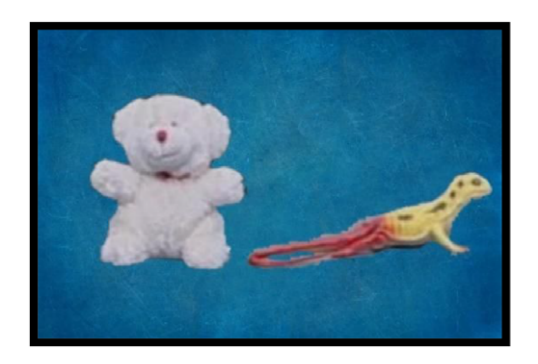
Figure 2. Objects used for the Multimodal Imitation Task Note. Teddy bear and toy lizard used for the Multimodal Imitation Task.

Note. Familiarization example and 12 video-recorded prompts included in the Multimodal Imitation Task, temporally organized as a sequence of conversational prompts.