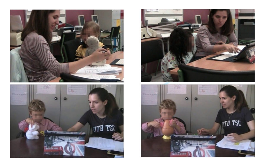
Figure 4. Stills taken from video-recordings of the experimenter and children carrying out the tasks Note. In the top left panel, the experimenter and a child carrying out the Renfrew Bus Story Test. In the top right panel, the experimenter and a child carrying out the Audiovisual Pragmatic Test. In the bottom left panel, the experimenter and a child carrying out the Multimodal Imitation Task. In the bottom right panel, the experimenter and a child carrying out the Story Test. In the bottom right panel, the experimenter and a child carrying out the Multimodal Imitation Task. In the bottom right panel, the experimenter and a child carrying out the Story Test.

saw modeled in the video and that they had to repeat the actions in the same order. The video was paused again before the third and last demonstration while the experimenter reminded the children that this would be the last demonstration before they had to imitate the pattern. Verbal cues such as Mira això! 'Look at this!', Oi que és divertit? 'Isn't this fun?' and Una última vegada! 'One last time!' were used in the video before each demonstration and also before each action in the sequence to capture the attention of the children. After the children watched the three demonstrations, the experimenter handed the torso and other body parts of Mr. Potato Head<sup>®</sup> to the children and encouraged them to imitate the sequence shown in the video by saying Ara et toca a tu! 'Now it's your turn!'