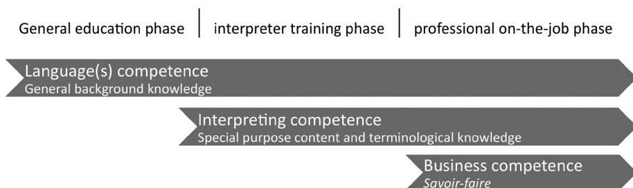
Table 2. Timeline for the development of interpreter competence.

When asked about interpreter competence development, what immediately came to mind to the interpreters interviewed was (linguistic) knowledge of their mother tongue and foreign language(s), the technicalities of interpreting proper, and business-related know-how. There is a general consensus about the timeline and chronological development of interpreter competence(s). Language(s) competence needs to have been acquired prior to the study/university course phase; command of one's mother tongue must be 'perfect' and foreign languages must already be at a high level of proficiency. This competence is then further developed and cultivated during university courses, in stays abroad, and in the post-study professional work phase. Interpreting competence proper is learnt during interpreter training and is maintained on the job. It refers to simultaneous and consecutive modes and, thus, to simultaneous comprehension, transfer, production, and monitoring, as well as to the necessary strategies, and, for the consecutive mode, to additional mnemonic and note-taking techniques (I-6 b ). Business competence is – excluding some basic facts and ideas – only acquired in the post-study working phase. It includes the whole range of skills involved in setting up a business, managing a small-scale enterprise, and establishing and maintaining good customer contact and relations (see the para-process skills in Albl-Mikasa 2012: 86-87).