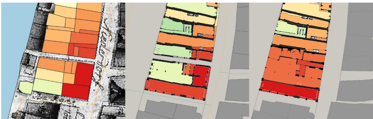
Figure 2. Detail of reconfigurations between 1793 (left), 1950 (middle) and 1990 (right). The densely partitioned merchant row houses were frequently infused with generous, open ground floor spaces joining the accessibility potential of both addresses. In this case, the fusion of three houses and the integration of an alley led to the emergence of a specific type tailored to the exceptional potential of the location.

The first case study investigates the turn-over of a slice of generic, serial tissue along the main artery of the merchant town on the east bank following the construction of a new quayside around 1855 (Abegg et al. 2007: 167-172). The new Limmatquai took over the role of a main north-south throughfare from the former artery, immediately acquiring significantly higher centrality values than the latter. Following subsequent modifications of the global network, the centrality gradient between the two streets increased even further. The fifteen plots in question obtained a second address, providing them with major gains in accessibility. This polarity reversal seems to have initiated a series of transformations affecting both plot pattern and building typology. As a result, the original row of congeneric buildings has given way to a heterogeneous conglomerate, integrating fragments of buildings from various phases in time (Abegg et al. 2007:167).