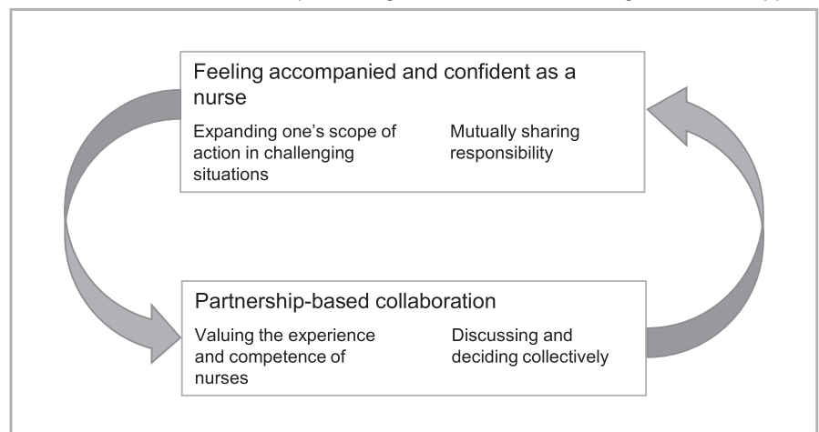
FIGURE 2 Main categories and subthemes of the analysis