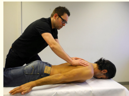
Figure 4: Test 4: Scapular Stabilisation Test in Glenohumeral Extension and Lateral Rotation Against Resistance (Dominant Trapezius Ascendens).

The subject was in a prone position, both arms positioned alongside the body, fingers pointing to the toes. The examiner stood next to the treatment table at the level of the subject's pelvis. Both hands were positioned laterally and caudally at the angulus inferior. The examiner moved the subject's scapula into the required position (retraction, adduction, slight upwards rotation). The subject lifted his/her arms in extension and outward rotation off the treatment table. The examiner provided resistance at both anguli inferiores in direction of the downward rotation and cranialisation. The subject had to hold this position for 10 seconds against maximum resistance.