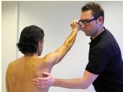
Figure 2: Test 2: Scapular Stabilisation Test at 130° Flexion Against Resistance (Dominant Serratus Anterior).

The subject sat upright, the upper arm at 130° flexion, the lower arm in a neutral position. The examiner stood next to the subject. The closer hand was placed laterally at the angulus inferior to register any scapular movements. The other hand provided resistance at the subject's fist in axial direction of the arm and at the same time towards the ground. The subject had to hold this position for 10 seconds against maximum resistance.