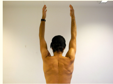
Figure 7: Test 5b: Initial Position - Motion Control Shoulder Shrug Test, Arm Elevation (Dominant Trapezius Descendens).