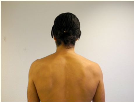
Figure 5: Test 5a: Initial Position - Motion Control Shoulder Shrug Test in Neutral Position (Dominant Trapezius Descendens).