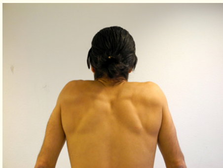
Figure 6: Test 5a: Final Position - Motion Control Shoulder Shrug Test in Neutral Position (Dominant Trapezius Descendens).