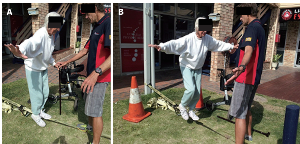
Figure 2 Right lower limb affected stroke patient participating in Slackline balance training. A: Therapist assist - single stick; B: Patient 1 leg stand with no balance aids - therapist standby assist.

that affects the ankle directly and less so the knee - regardless of joint stiffness [29] ; and the quadriceps H-reflex primarily affecting the knee control [31] . Both of these actions are also partially disordered during hip movement due to modulated limb spasticity [34,35] . The anticipated beneficial consequence is that the action of slacklining may provide a positive effect through the action of pre-synaptic inhibition and down-regulation of the H-reflex [27] as well as supplement the quadriceps and soleus activation and control [12] in conjunction with balance, postural control, and an overall learning process [14,18,24] . This can assist the individual to adapt towards normalized balance and actively controlled positions [36] . The anticipation is that this specific action within the training phase will then overflow to normal daily activity [17,18] including the functional movements of walking and postural control. This in theory could subsequently improve the innate response action to perturbations and reduce the incidence of falls and in turn improve individual confidence while reducing health and socioeconomic costs [36] .