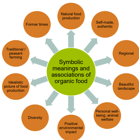
Figure 1: Overview of symbolic meanings and images related to organic food

The sensory image of organic products in Switzerland is good but sensory deficits are an important barrier to organic consumption. Fresh produce, dairy products and other "healthy" and low processed categories are linked with a good sensory image. In Switzerland, most consumers perceive organic food as full of taste and prefer the organic alternative when the organic label is presented. For organic yoghurt the consumers expect natural and authentic sensory ingredients.