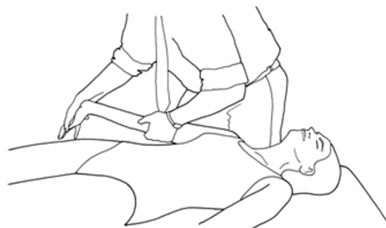
ULNT MEDIAN (2a)