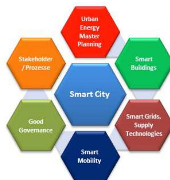
Fig. 1: Understanding of smart cities in Switzerland (Smart City Schweiz, 2014b).

In Switzerland, a smart city is understood to be a city which provides the maximum available quality of life at minimal use of resources thanks to intelligent connections of infrastructure (transport, energy, communication) at different hierarchical levels (building, quarter, city; Smart City Schweiz, 2014a). A smart city links topics such as urban energy master planning, smart buildings, smart grids and supply technologies, smart mobility, good governance and stakeholder processes (see Fig. 1).